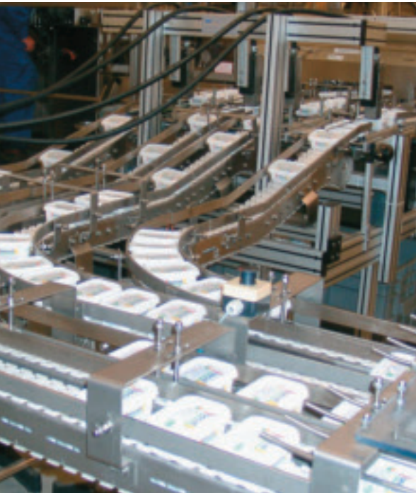
production line: transfer to packaging area. The system based output and improved machine access.