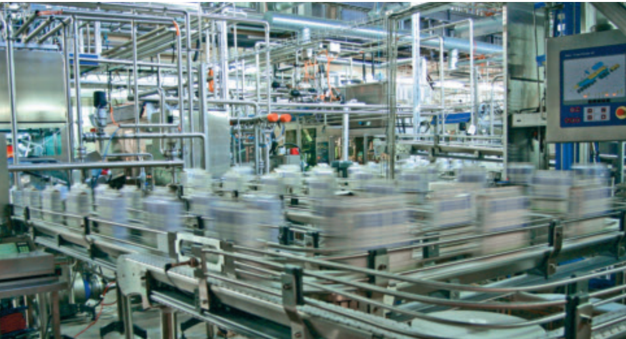
High speed conveyor system for 200 ml to 1 litre milk cartons. Dynamic buffering and gates for a compact, flexible layout.