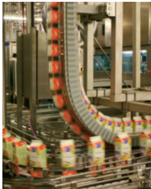
Constant elevation allows compact, 3-dimensional layouts. Here elevation to an overhead transport to the palletizing area.