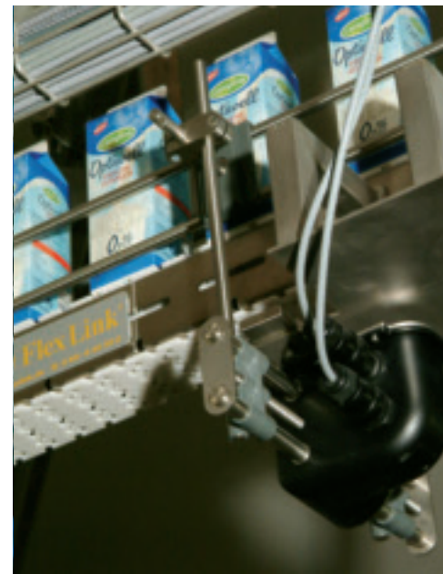
Fast and easy changeover between different packaging sizes. The Automatic Guiding Sys- tem (AGS) makes the re-setting in seconds.