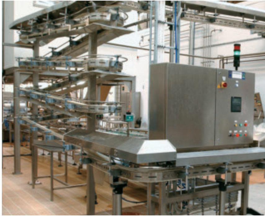
In-line, high capacity buffering and loweration of ready made meals.