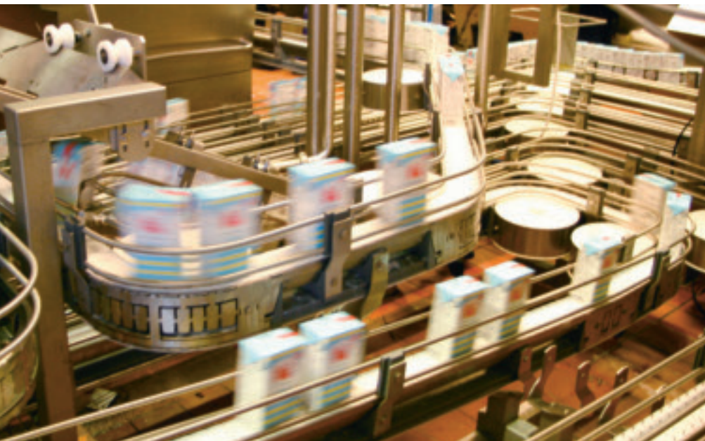
A matrix layout combines the fillers with packers, any filler to any packer but one at a time. Hygienic conveyor platform.