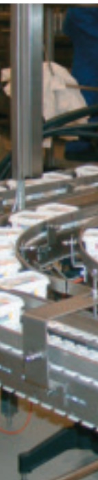
Margarine packaging offers increased