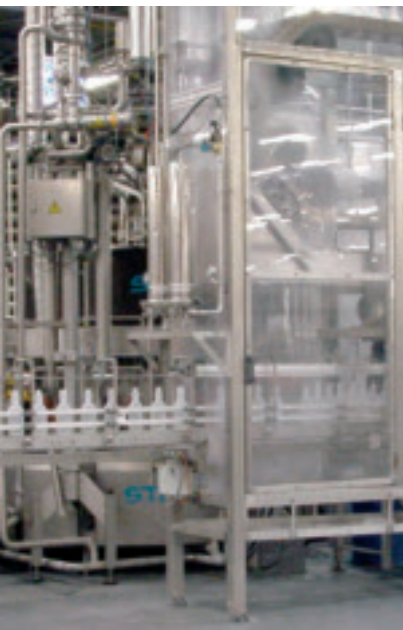
of empty PET bottles