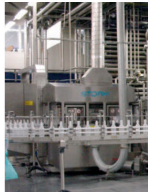
A high capacity in-line rinser cleaning six sizes between un-scrambler and filler.