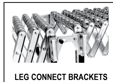
LEG CONNECT BRACKETS

LEG CONNECT BRACKETS —Connecting two or more conveyors.